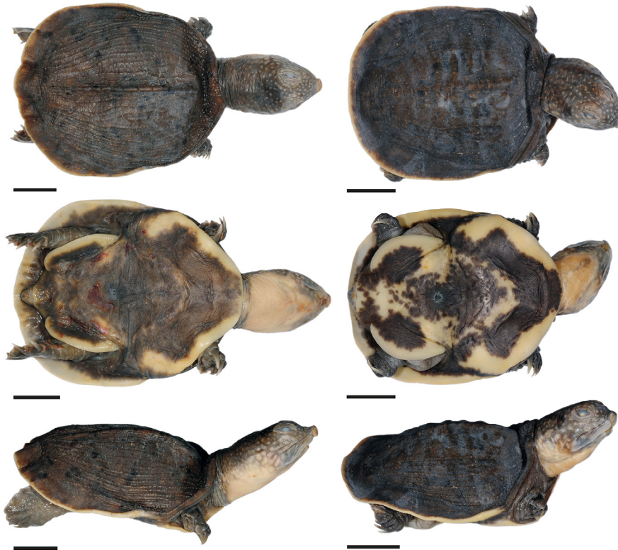
Fig. 2. Hatchlings of Cyclanorbis senegalensis from the vicinity of Ugudi village at the Alwero river, Gambela Region, western Ethiopia. Left: MTD D 49181, right: MTD D 49182. Scale bars, 1 cm.

blocks were concatenated and merged for calculations with previously published homologous data of all four African flapshell turtle species. Sequences of Lissemys ceylonensis were included as outgroup (Table 1). Phylogenetic trees were then computed using Bayesian Inference and Maximum Likelihood approaches as implemented in MRBAYES 3.2.1 (Ronquist et al. 2012) and RAxML 7.2.8 (Stamatakis 2006). In addition, uncorrected p distances between concatenated DNA sequences were